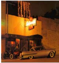
The grand old brick building houses the Continental Club. Now a popular live music venue for the past 50+ years, it has been a landmark in Austin since 1957.